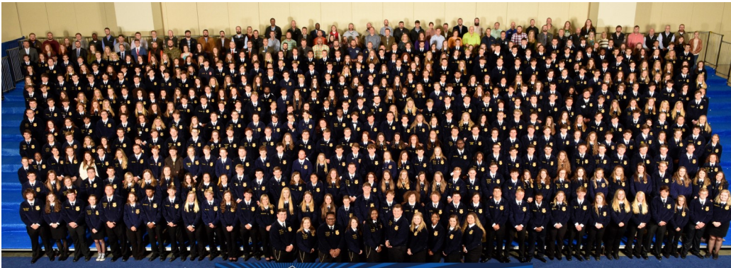
More than 800 Alabama FFA members attended the 92nd National Convention in Indianapolis, Ind.