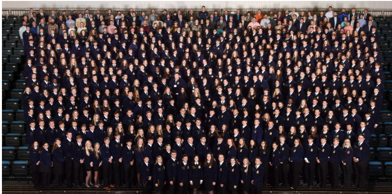
More than 800 Alabama FFA members attended the 90th National FFA Convention in Indianapolis, Ind.

FFA Motto: Learning to Do Doing to Learn Earning to Live Living to Serve