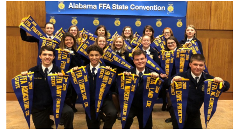
Enterprise FFA Members pose with 23 state-winning banners at 2018 Alabama FFA State Convention.

industry. Thank you, donors, for everything you do for members and the future of agriculture!"