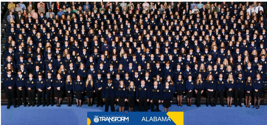
Nearly 600 members of the Alabama FFA delegation to the 89th National FFA Convention in Indianapolis, Indiana.

FFA Motto: Learning to Do Doing to Learn Earning to Live Living to Serve