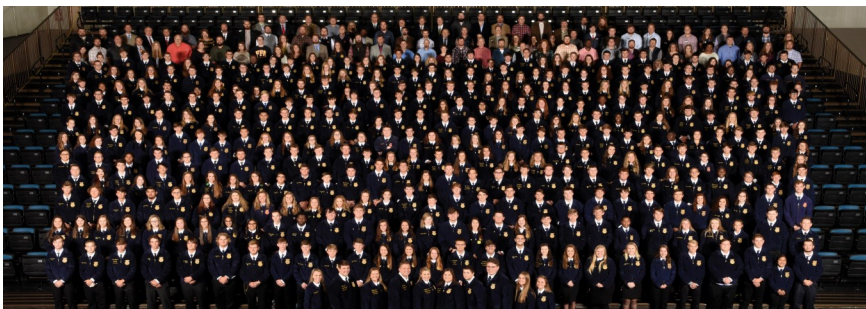
More than 800 Alabama FFA members attended the 91st National Convention in Indianapolis, Ind.

*Visit alabamaffa.org for more information on these recognition opportunities.