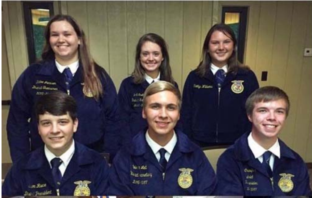
Your 2016 Alabama FFA North District Officer Team