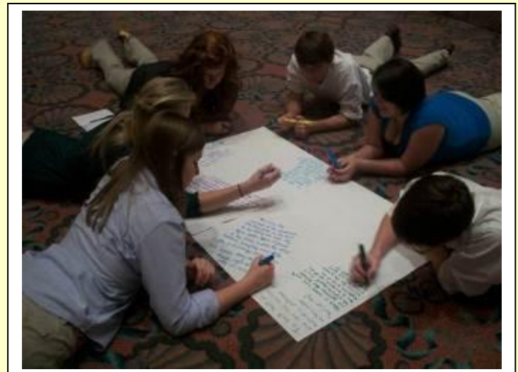
Right: 2010-2011 Alabama FFA State Officer Team working at NLCSO in Daytona, Florida