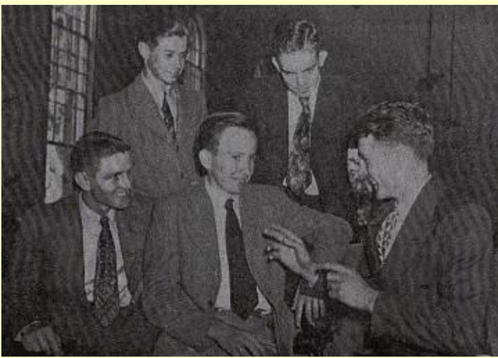
Above: of 1946-1947 Alabama FFA State Officer Team