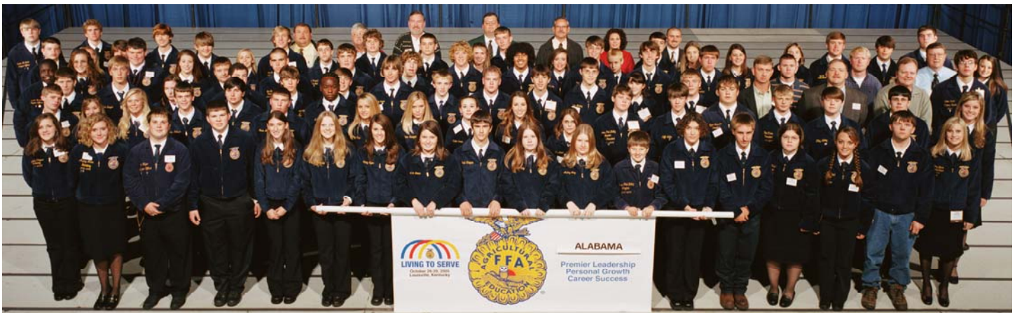
Pictured above are the members and advisors of the Alabama FFA Association that could make the scheduled time for Alabama’s State Photograph at the 2005 National FFA Convention in Louisville, Kentucky. Alabama had over 500 students, advisors and supporters registered for the National Convention. Make it your chapter’s goal to be included in this photograph at the 2006 National FFA Convention in Indianapolis, Indiana.

Wow, the 78th National FFA Convention was a great year to end our seven-year run in Louisville! Our trip was filled with almost sleepless nights, wishing we had