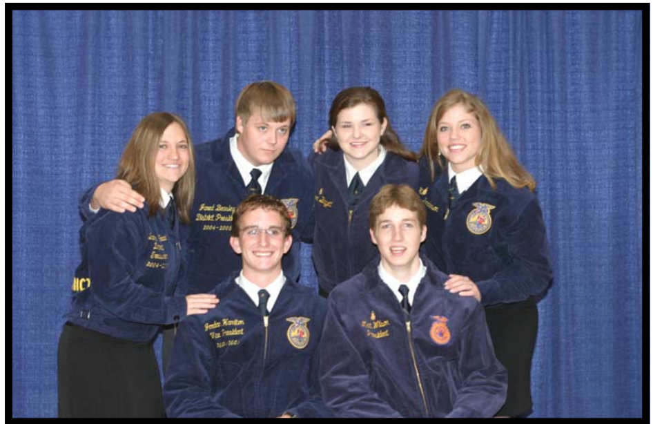
2005-2006 STATE FFA OFFICER TEAM—Newly Installed

As I started my first “Ag” class in seventh grade and began to learn about FFA, I realized that FFA is an inclusive, rather than an