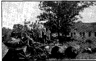
Members of the Pine Apple FFA are pictured with part of their collection of 18 tons of scrap metal.