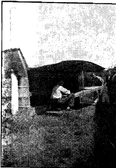
FFA and FHA boys and girls of Danville High School have built a school drying plant to help conserve food for the victory program. They are shown evaporating apples, and some of the fruit will be used at the annual banquet.